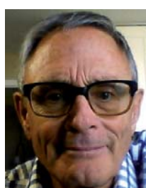
Gordon Cook Chair: Special Events*