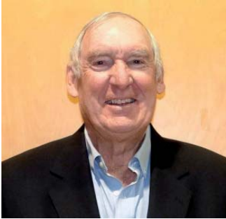
Bill Troy Construction