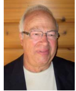
Lloyd Warnes Marketing