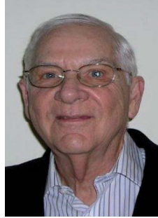
Charlie Corinaldi Financial Services