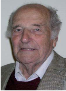
Jim Cairns Environment