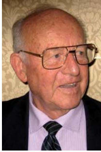
Mark Andreassen Auto Dealership