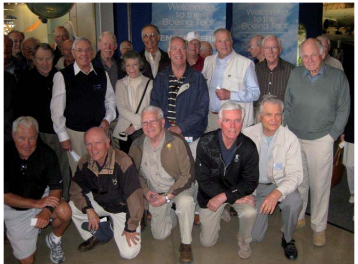
Below: Two photos from the Boeing Tour. Two were necessary to endeavour to include all the happy attendees.