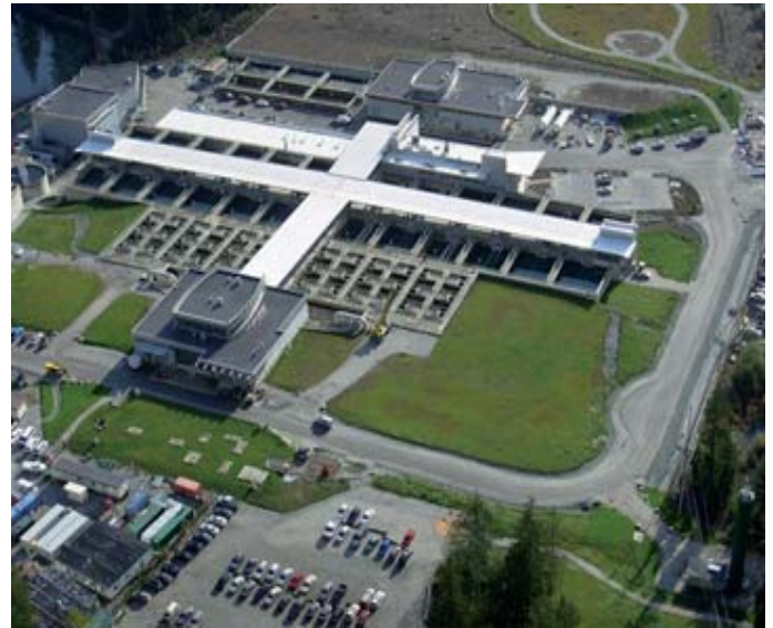
Above: Photo of Seymour/Capilano Water Filtration Plant

A barbeque style lunch will follow on the patio of the Seymour Golf Club. Dress code is golf shirt with collar, no jeans. This promises to be an interesting and entertaining outing - see you there! Contact Fraser Grant by phone at 604-921-6660 or fsgrant@shaw.ca .