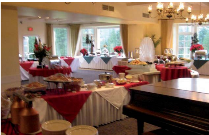
Banquet room all set for the hungry banquet guests