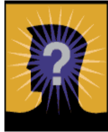
To Be Nominated Chair: Special Events