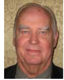
Owen Johnson Export, Distribution