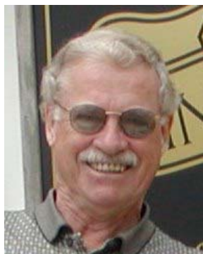
House: Phil Boase