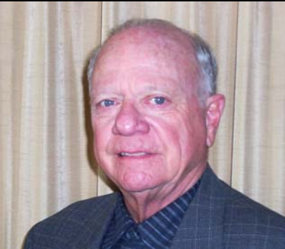
House Art Eberwein